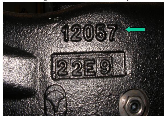
Figure 3 – Differential Support